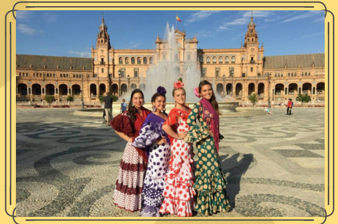
10 hours of instruction ending shortly before the April Fair.