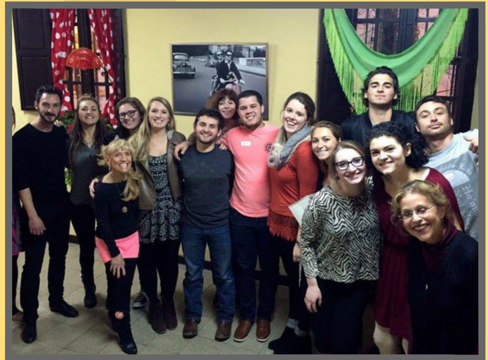
Spring 2016 class.

Flamenco: intangible patrimony of humanity.