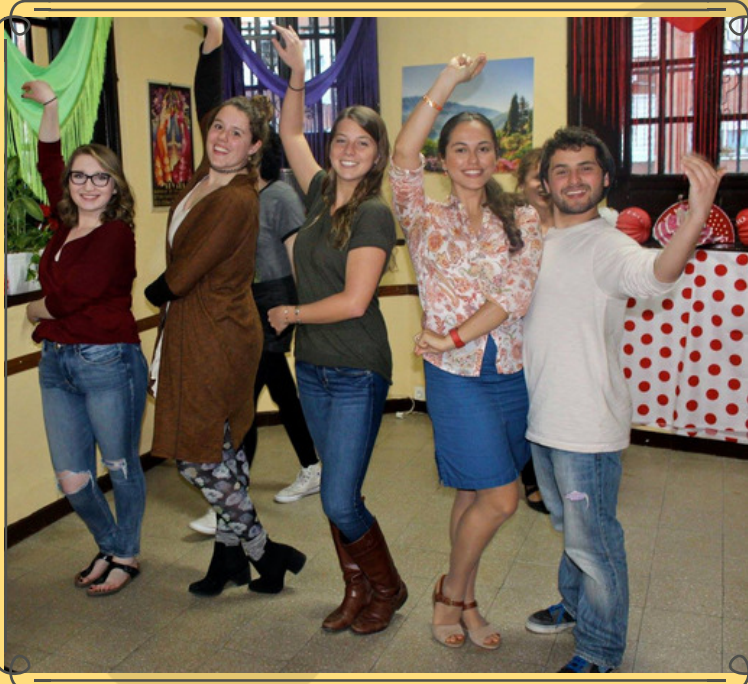
The comfort of having class directly at the ICS.